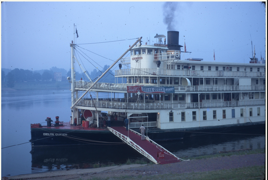
The Delta Queen steamboat docked at the public landing in Marietta, Ohio in the fall of 1971.